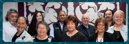
Te Whakaruruhau Matua is comprised of the Chairs of each Whakaruruhau (pictured left).