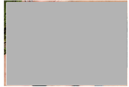
Kiwi chick having its transmitter checked and beak measured.