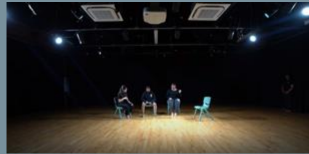
Scene 5 Set: Home/dinner table Lighting: Soft white lighting