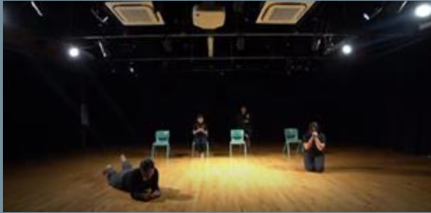
Scene 1 Set: Home Lighting: Bright white lighting