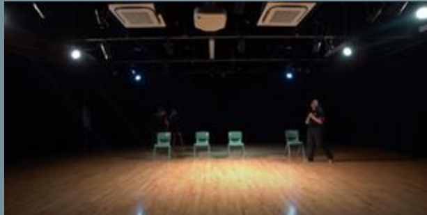
Scene 4 Set: School Lighting: Soft white lighting