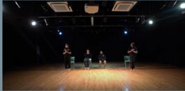
Scene 2 Set: Church Lighting: Soft white lighting