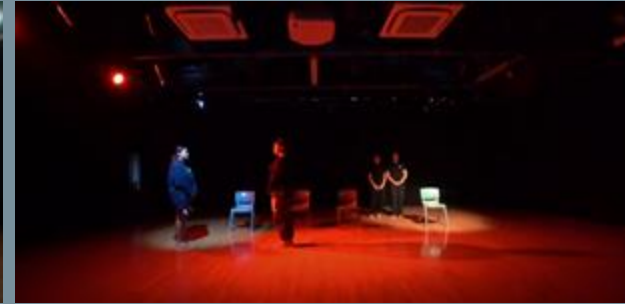
Scene 3 Set: Split stage - Party on the left, school on the right Lighting: Spotlight lighting