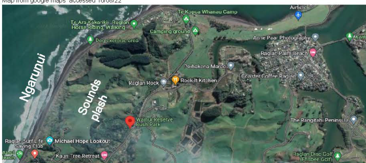
Map from google maps accessed 16/08/22