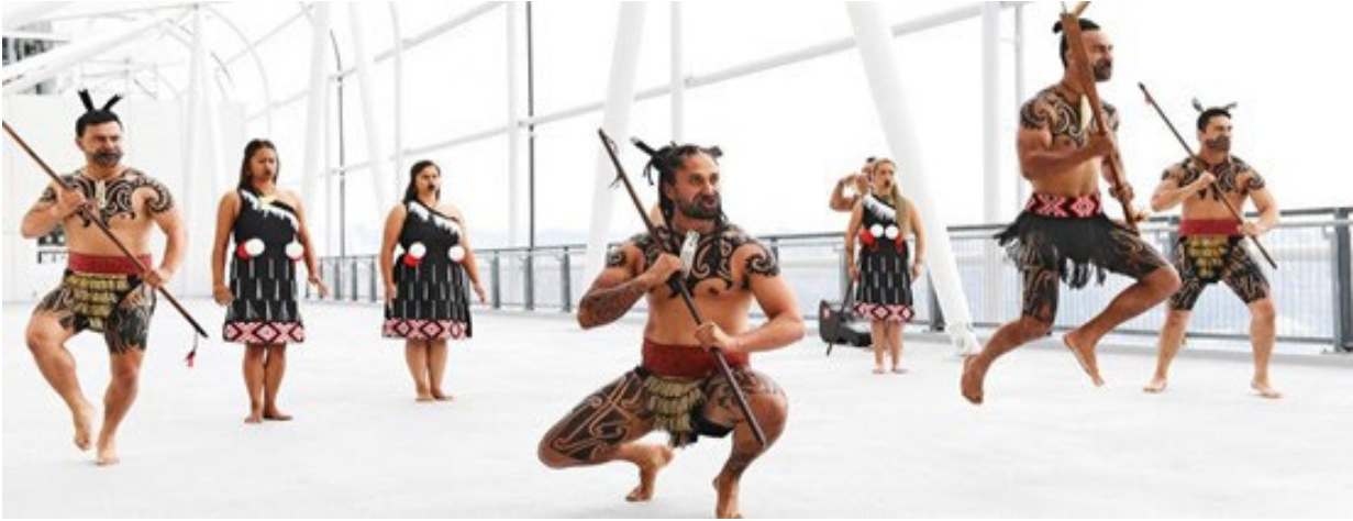
Ngā Kaiwero ki Eden Park, Tāmaki Makaurau.