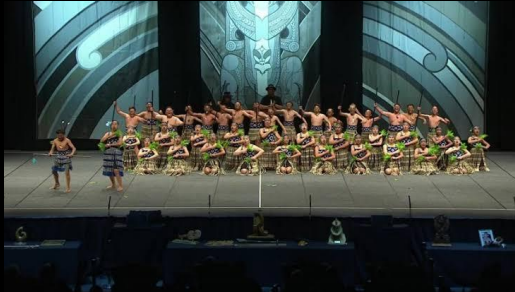
Te Kura o Te Paroa 2019