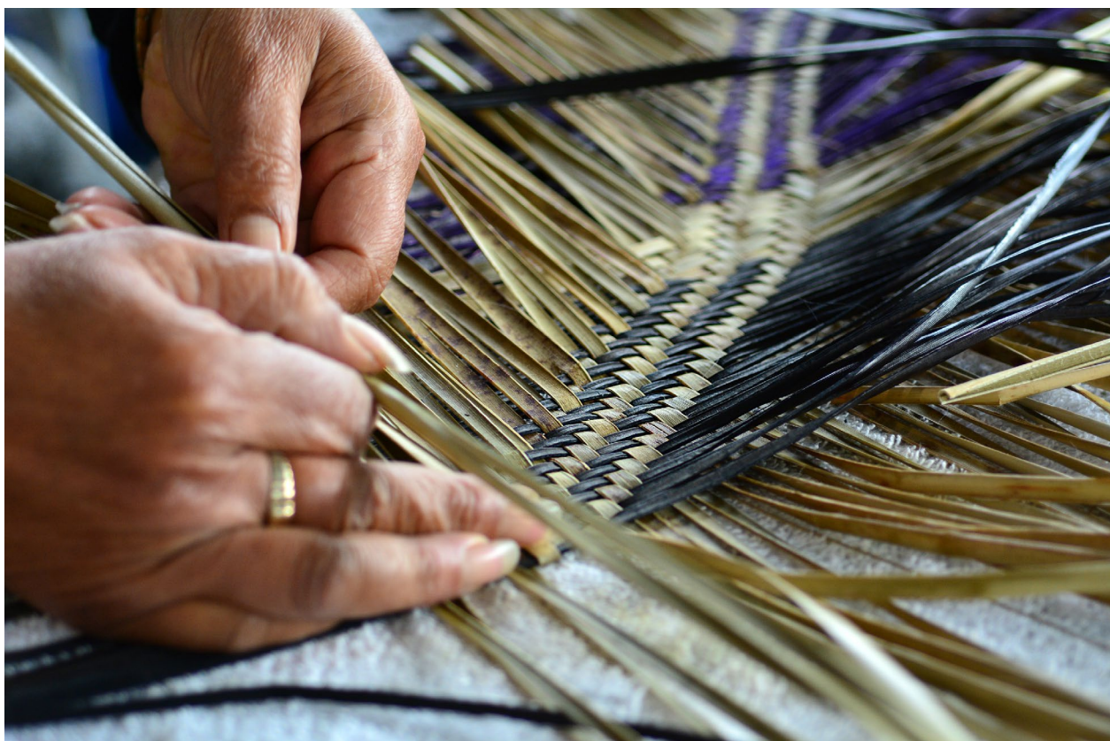
Māori Woven Artwork.

If you require help with the submission process, please make speak with your Teacher who will help you through this process.