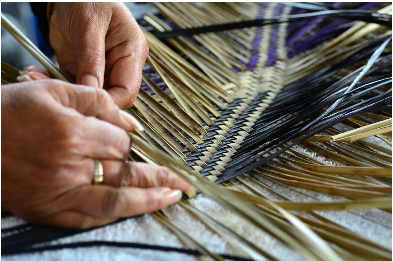
Māori Woven Artwork.

If you require help with the submission process, please make speak with your Teacher who will help you through this process.