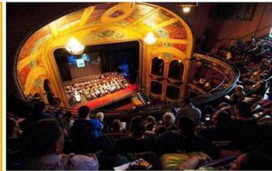
This is the view of the stage from the audience's point of view. As you can see in the picture the stage and the theatre are used for music shows, dance recitals, plays, and other theatrical performances and of course fashion shows. The models in the fashion will walk from the back of the stage to the front little pontoon and then across to either side of the stage and then back to the beginning. The rest of the stage will be blocked off so then the audience won't be able to see the models getting ready for the show.

"This issue provides me with the opportunity to show my design and fashion knowledge skills in a school fund raising event"