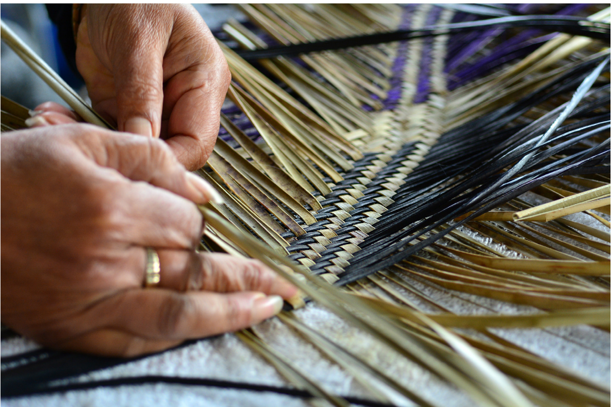
Māori Woven Artwork.

Mēnā kei te hiahia āwhina ki te tuku atu i ngā tāpaenga Kete Manarua, tēnā, kōrero ki tō Kaiako, ā, māna koe e awahi, e tautoko.