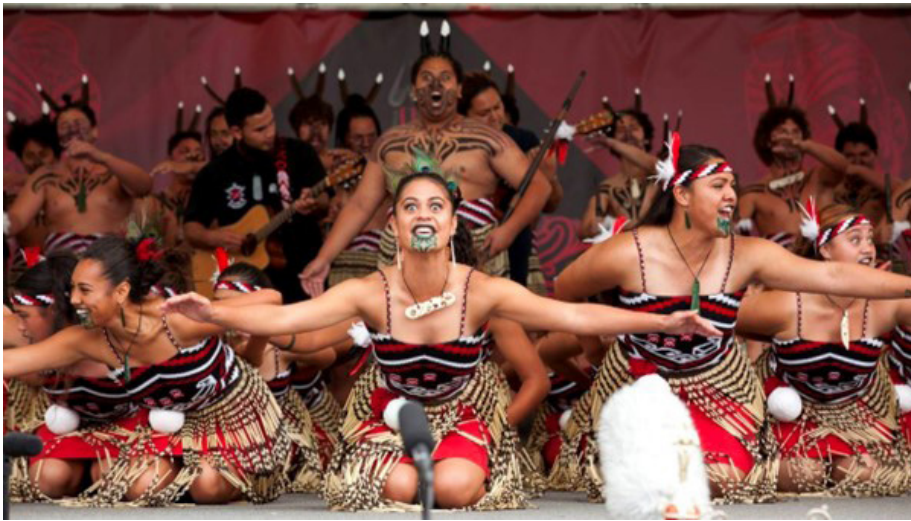
Te Wharekura o Hoani Waititi Marae, 2016 ASB Polyfest.

He maha ngā tikanga Māori ki roto i te ao Kapa Haka. Hei tauira; ko ngā waiata tawhito, ngā momo moko, ngā kākahu, te tū ā-lwi me te mita o te reo. Ko tāu nā mahi, he whakarite i tētahi whakaaturanga e whakamārama ana i ngā hua pai, kino rānei o ēnei tikanga, ngā tuku ihotanga o te mātauranga me ngā ariā matua e pupuri ana i te mana me te mauri o ērā tikanga.