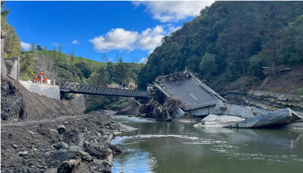
Te arawhiti o te awa o Waikari kua riro i te parawhenua mea 2023).