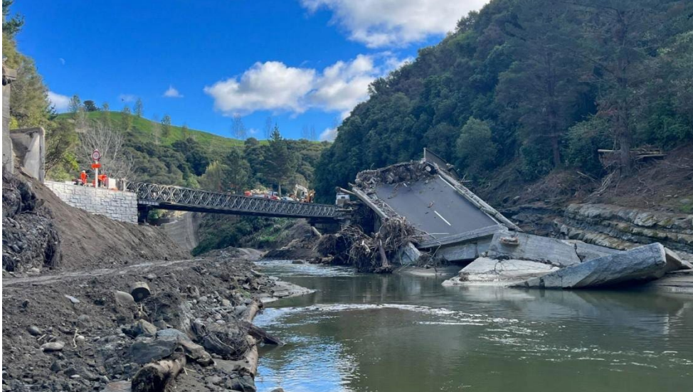
Te arawhiti o te awa o Waikari kua riro i te parawhenua mea 2023).