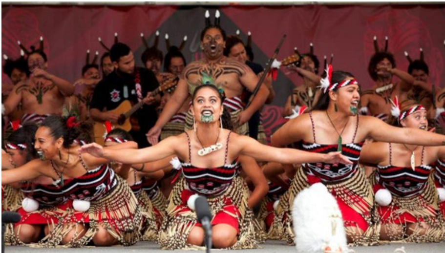
Te Wharekura o Hoani Waititi Marae, 2016 ASB Polyfest.

He maha ngā tikanga Māori ki roto i te ao Kapa Haka. Hei tauira; ko ngā waiata tawhito, ngā momo moko, ngā kākahu, te tū ā-iwi me te mita o te reo. Ko tāu nā mahi, he whakarite i tētahi whakaaturanga e whakamārama ana i ngā hua pai, kino rānei o ēnei tikanga, ngā tuku ihotanga o te mātauranga me ngā ariā matua e pupuri ana i te mana me te mauri o ērā tikanga.