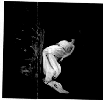
Artist Brooke Shaden Title uneven staircase

it looks like the colour was manipulated to look more dark and toned. Also the edges of the photo have been darkened helping draw the focus more towards the centre of the photograph. I don't think much else was done post-production. This photo looks staged so all the work would have been done before the photo was taken.