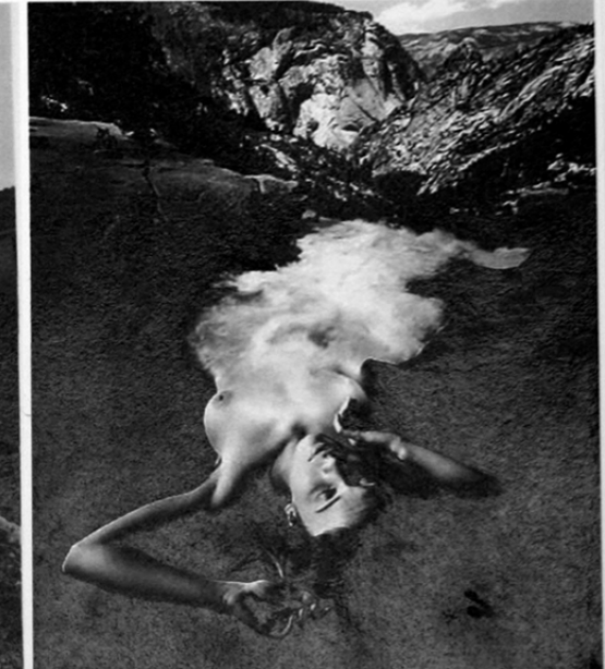
Jerry Uelsmann - Untitled, 1992