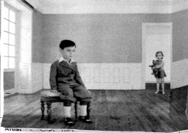
Artist Boyd Webb Title The Green Room