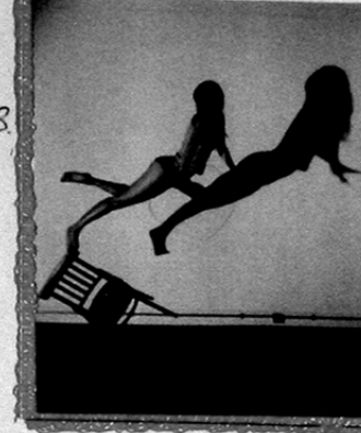
Artist Boyd Webb Sam Taylor Wood Date 1985 Title Blessed shadow

Tableau vivant (Staged Photography only) Tableau vivant means: