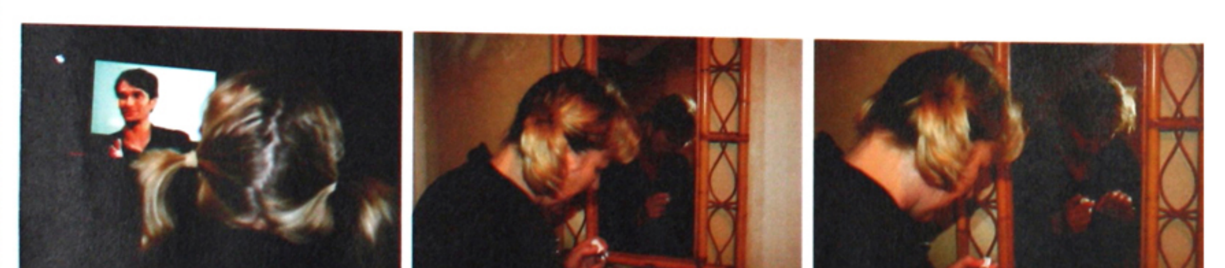
IMG_8780 IMG_8781 IMG_8782