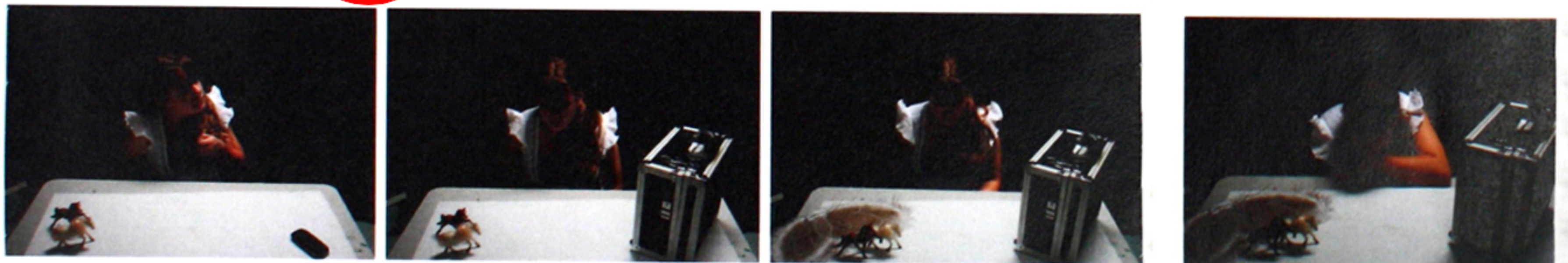
IMG_6149 IMG_6150 IMG_6151 IMG_6154