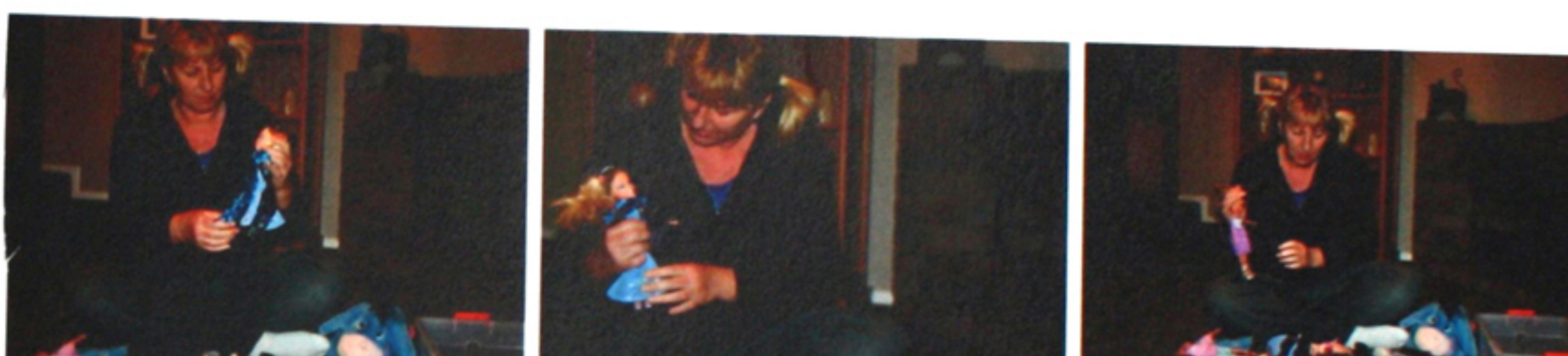
IMG_8761 IMG_8762 IMG_8763