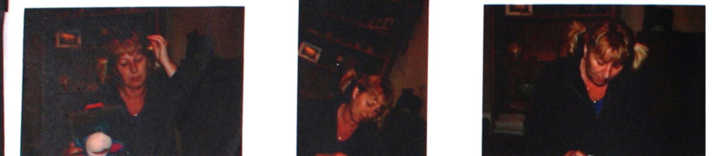
IMG_8770 IMG_8771 IMG_8772