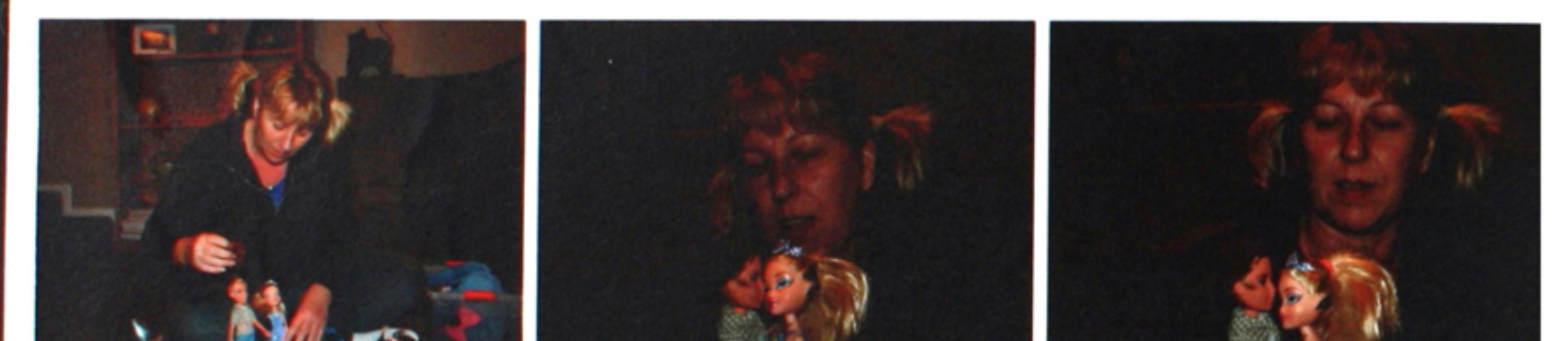
IMG_8773 IMG_8774 IMG_8775