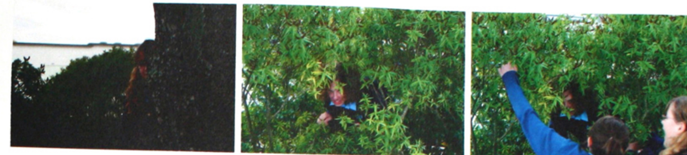
IMG_8767 IMG_8768 IMG_8769