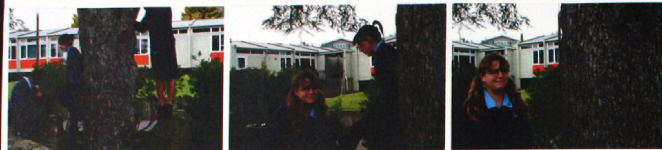
IMG_8754 IMG_8755 IMG_8756