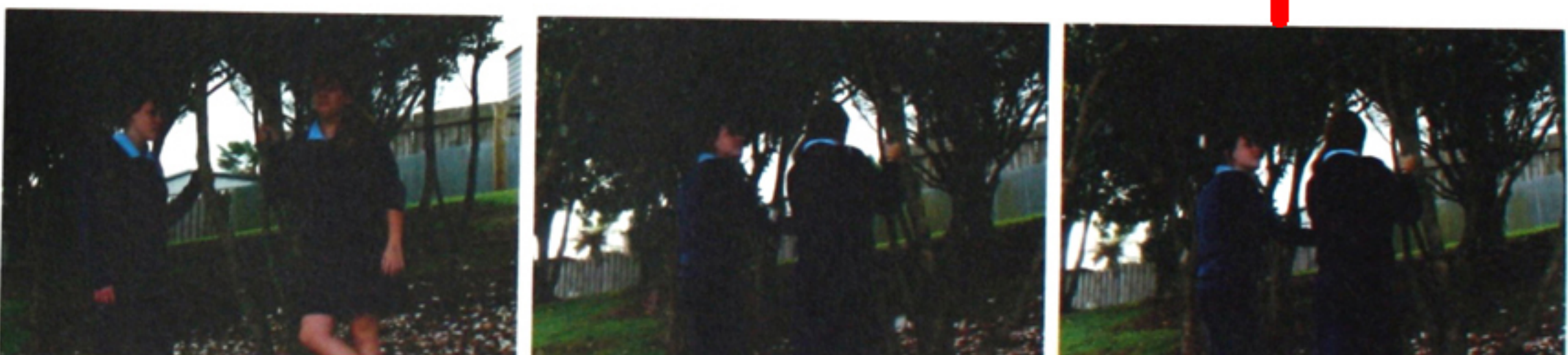
IMG_8775 IMG_8776 IMG_8777