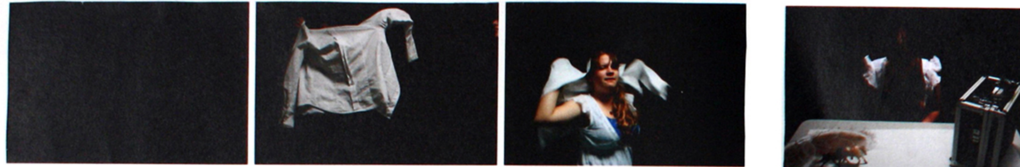
IMG_6143 IMG_6144 IMG_6145 IMG_6152