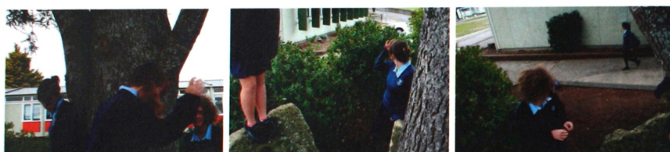
IMG_8757 IMG_8758 IMG_8759