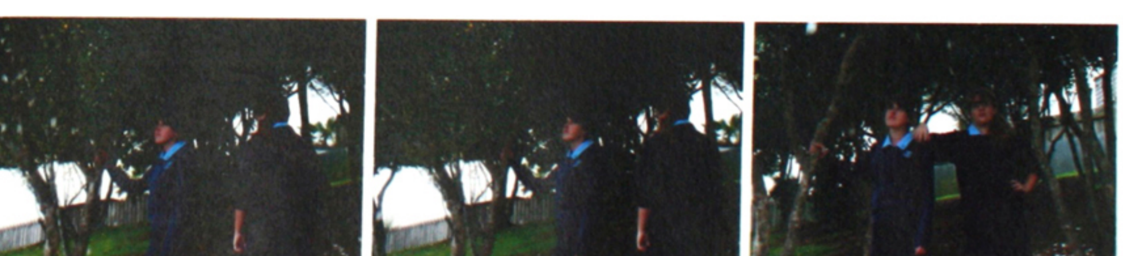
IMG_8778 IMG_8779 IMG_8780