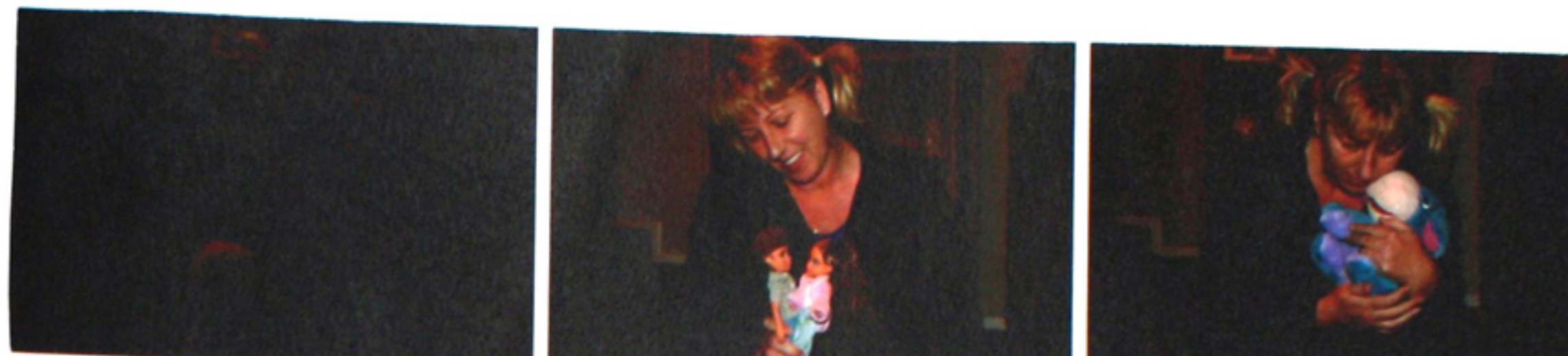
IMG_8758 IMG_8759 IMG_8760