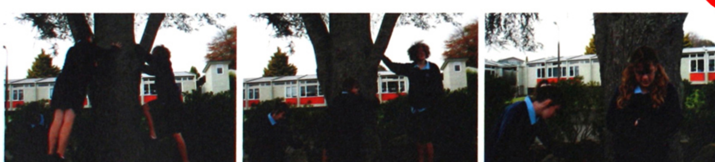
IMG_8760 IMG_8761 IMG_8763