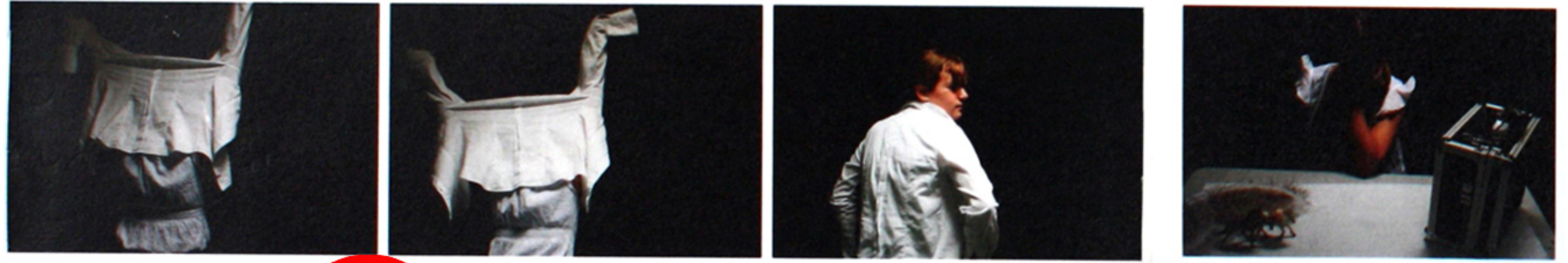
IMG_6146 IMG_6147 IMG_6148 IMG_6153