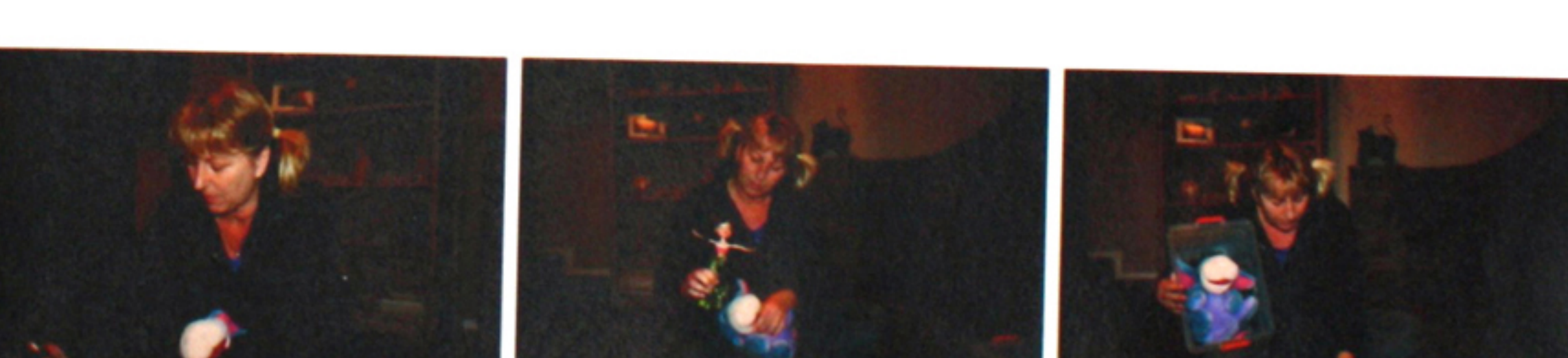
IMG_8767 IMG_8768 IMG_8769