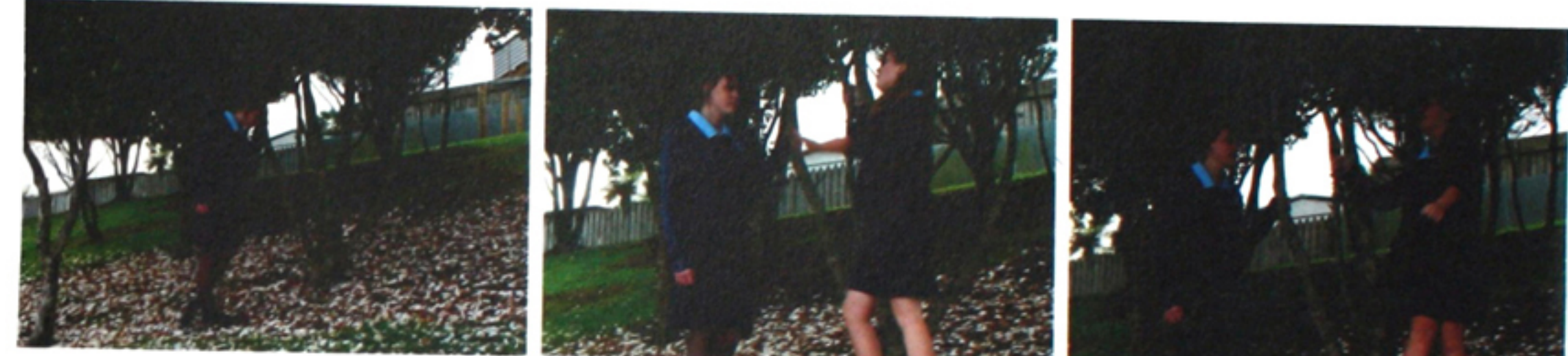
IMG_8772 IMG_8773 IMG_8774