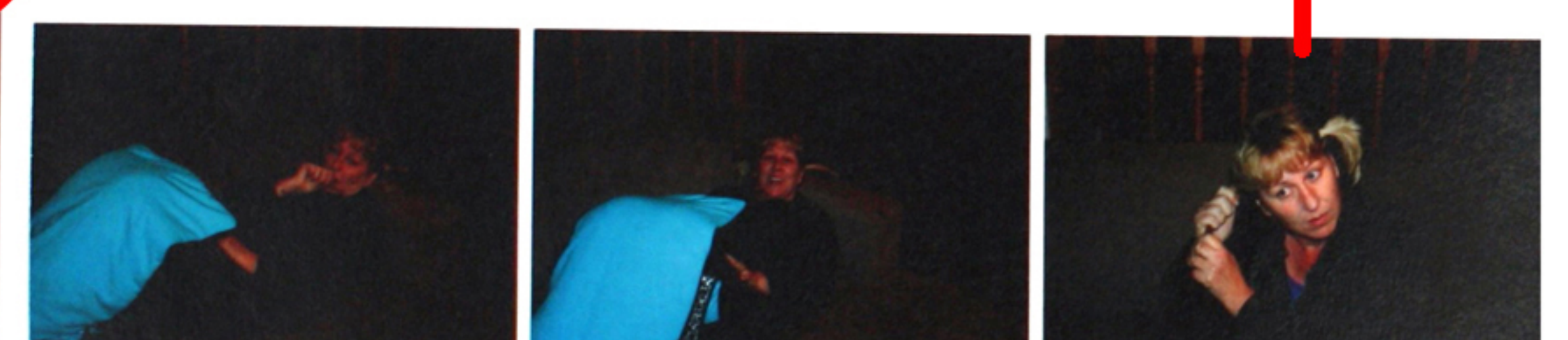
IMG_8776 IMG_8777 IMG_8779