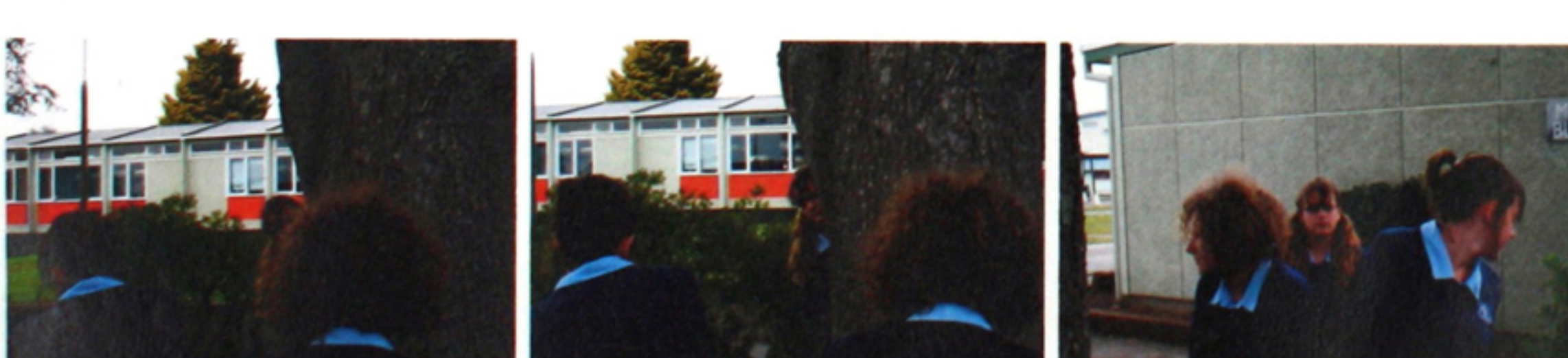
IMG_8764 IMG_8765 IMG_8766