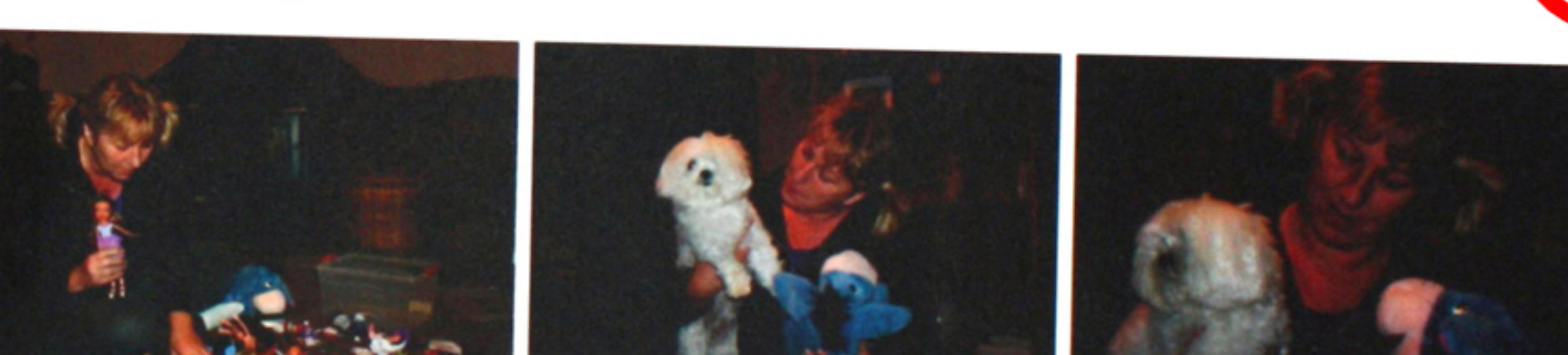
IMG_8764 IMG_8765 IMG_8766