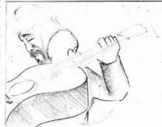
Task 2 - 1 x AS Composition and conventions