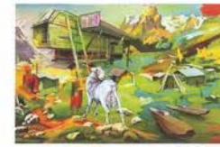
Task 2 - 1 x Artist reference and colour