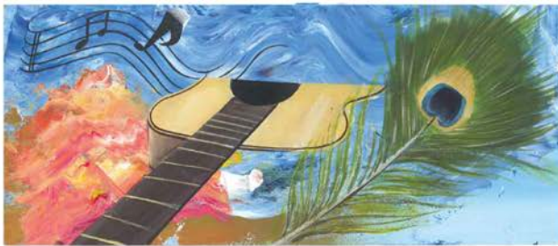
Task 3 - 1 x AS Demonstration of painting