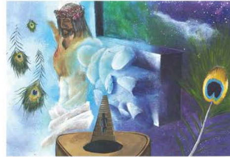
Pg.8 Task 2- 1 x AS Regenerate drawing and 1 x AS Photoshop drawing