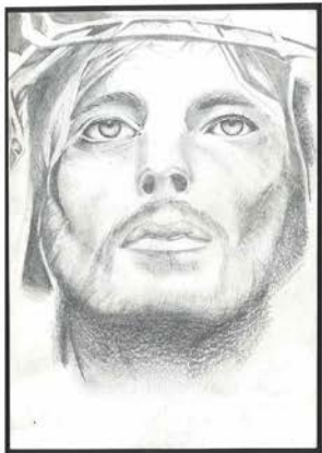
Task 2 - 2 x AS Tonal Drawings