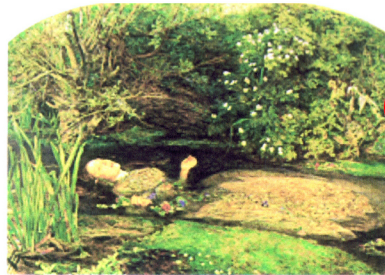
'Ophelia.' A fictional character from Shakespeare's play Hamlet who drowned herself singing.