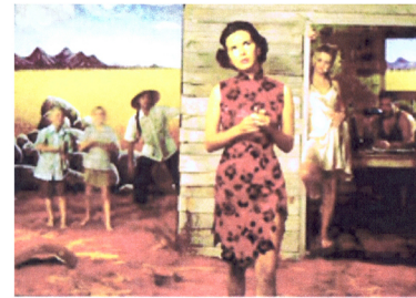
Tracy Moffatt She uses staged images based in a studio. Similar cinematic and filmic techniques to Crewdson.