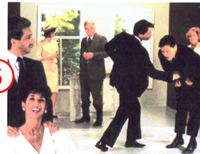
Nic Nicosia 'Violence' 1986 Staged photographs. They both deal with a wide range of themes that affect society.

This is from the series 'Twilight.' The meaning behind it is domestic, and the difference from natural to super natural. Twilight is the time in the evening where daylight changes to darkness. It is a place no one wants to be as there is a state of unknown. Looking at this image it raises many questions, why is there a lady floating? Is she dead? Has there been a flood?