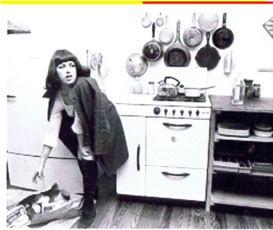
Cindy Sherman 'Untitled film still #4' Cindy Sherman creates a film set and like Crewdson imitates films. In this series she pose in different roles and settings from a typical film noir.