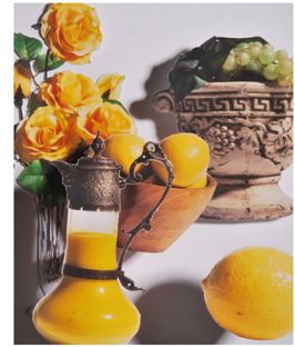
Cropped/close up, white background.