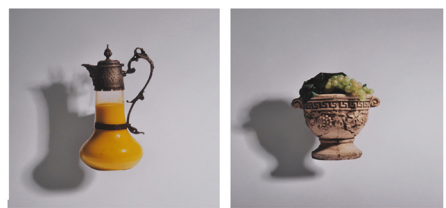
Singular images. Isolated images, white background

photographs of cut out photographs light casting shadow . 2 dimensional cut out photograph suspended over a background