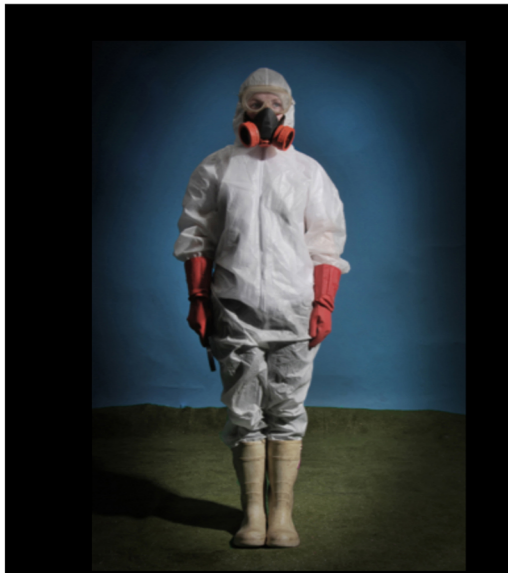
Developed into antiquarian emulation with a dull appearance in order to evoke the theme of hopelessness and pollution.