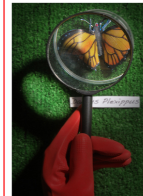
Depth of field Circular Motif Vibrant colours Light vignette