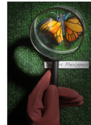
Desaturated Darker vignette circular motif Depth of Field selective colour range Saturated Butterfly