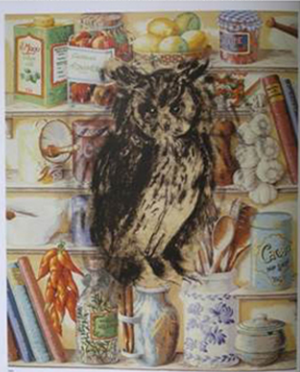
Owl in the Kitchen