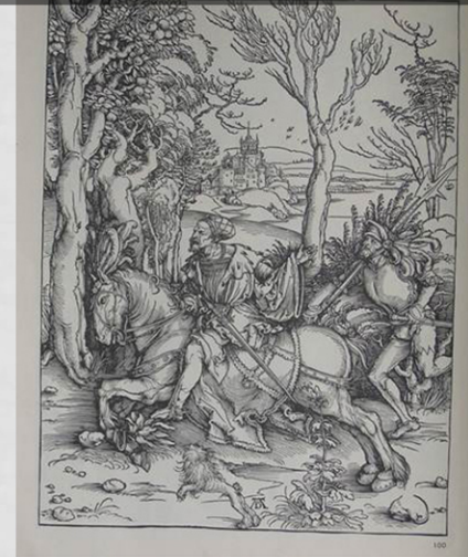
Knight and Landsknecht

This was made just before 1500 when everyone thought the world was going to end. Durer came from Northern Europe (Germany) which had a more pessimistic style than in Italy where it was warm and sunny. Artists like Raphael didn't often do such gloomy subjects.