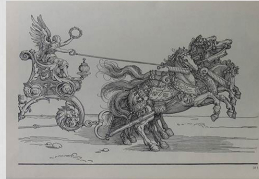
The so called small Triumphal Car (the burgundian marriage)