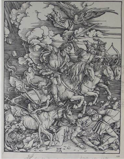
The four riders of the apocalypse

Albrecht however had a talent for art so gain an apprenticeship with at the time Nuremberg's leading artist Michael Wolgemut at the age of fifteen in 1486.