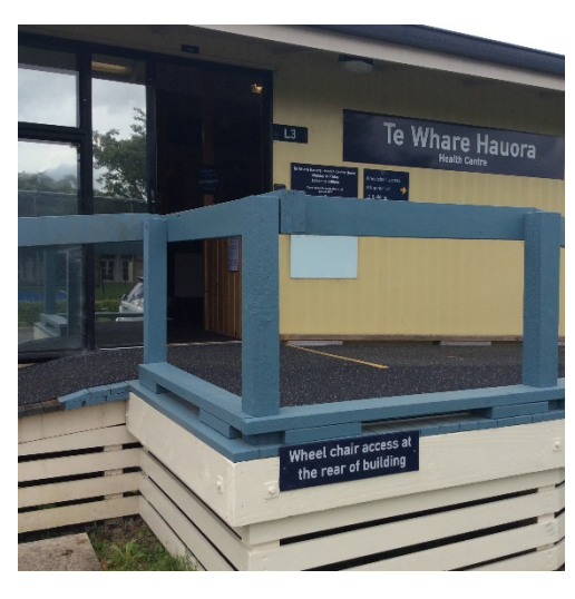
A health clinic